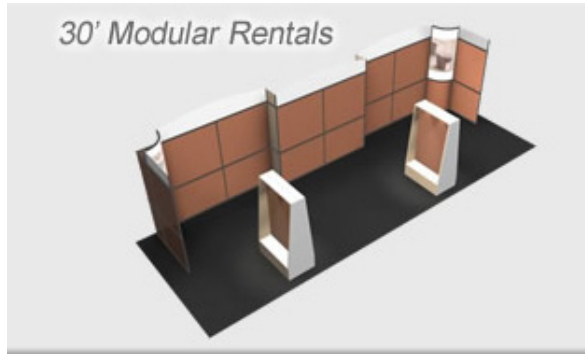
30' Modular Rentals

Our Rental Solution is fantastic if your attending multiple shows at the same time or are looking to attract different market segments at each show. When you purchase an Exhibit System you are locked into the same look and design, by renting with Online Display you could change your Exhibit design each and every time you attend a trade-show.