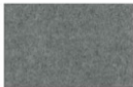
R03 Storm PMS 424C / 425C