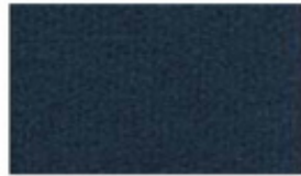
R12 Nebula PMS 2767C