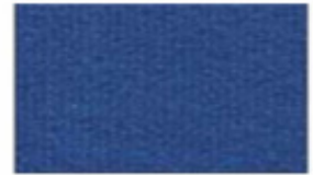
R06 Indigo PMS 294U