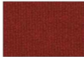
R08 Merlot PMS 195C