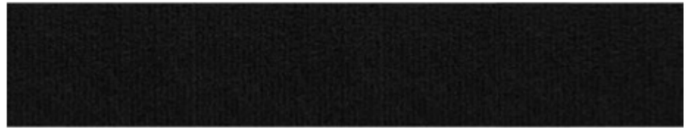
R01 Lava PMS BLACK 6C 2X