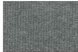
R03 Charcoal PMS 424C / 425C