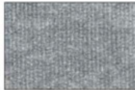
R02 Steel PMS 429U / 430U