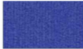
R05 Pacific PMS 280C