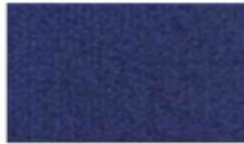
R04 Monarch PMS 281C / 282C