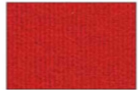
R11 Electric Red PMS 187C