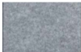
R02 Chrome PMS 429U / 430U