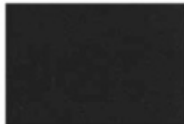
R01 Carbon PMS BLACK 6C 2X