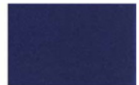
R04 Sapphire PMS 281C / 282C