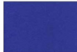
R05 Electric Blue PMS 296