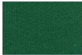
R09 Kelley Green PMS 3425C