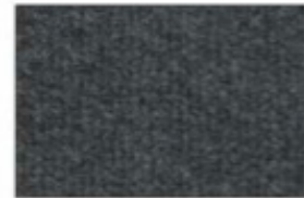
R15 Cinder PMS 426U