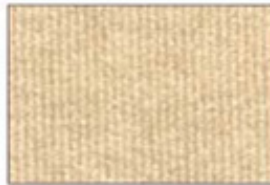
R07 Sand PMS 467U